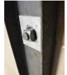
OR C-CHANNEL FOR CONCRETE BLOCK FOUNDATIONS

All components are hot-dip galvanized to increase product life in aggressive soils.